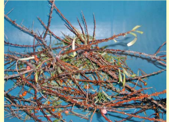
Branches and leaves