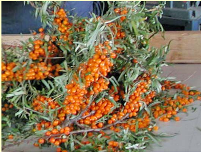
Cutting of branches